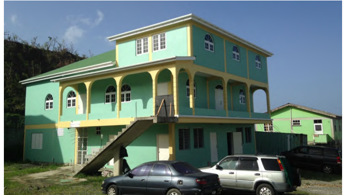
Berean Church in Roseau (Berean Christian Academy)

Teachers and students of the Berean Christian Academy (BCA) are looking forward to the reopening of school this