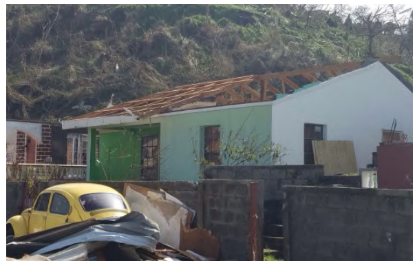
One of the houses of Berean members in Dominica damaged by the hurricane.