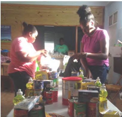
Members packaging food items for distribution