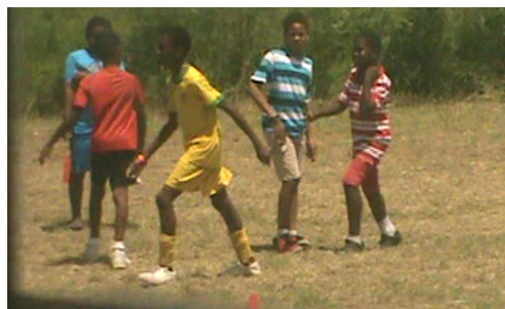
Campers play football during the staging of Sports Day