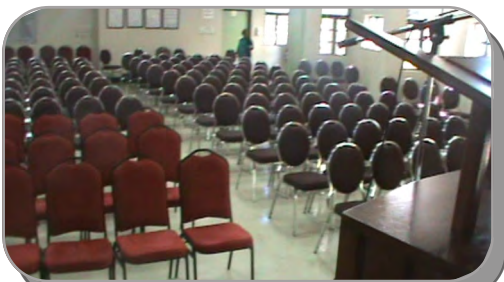
Inside The BWU Auditorium

Artistes supporting the Choir’s effort include the following: