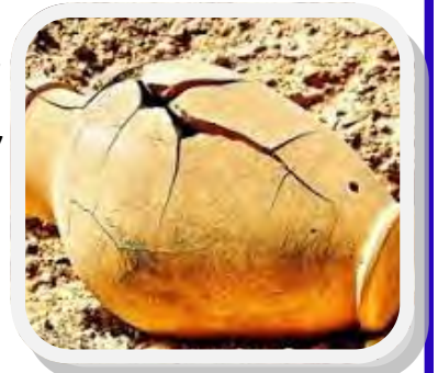
A Marred Vessel

“Now if anyone builds on the foundation with gold, silver, precious stones, wood, hay, straw— each one’s work will become manifest, for the Day will disclose it, because it will be revealed by fire, and the fire will test what sort of work each one has done. If the work that anyone has built on the foundation survives, he will receive a reward. If anyone’s work is burned up, he will suffer loss, though he himself will be saved, but only as through fire.”