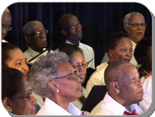
Berean choir and Friends

The Berean Bible Church will stage a Concert on Saturday, 30th May 2015 at the Sir. Hugh Springer Auditorium of the BWU’s Solidarity House , commencing at 6.00 p.m. Our Choir members will be joined by Friends who normally join them for special events such as Concerts and Cantatas.