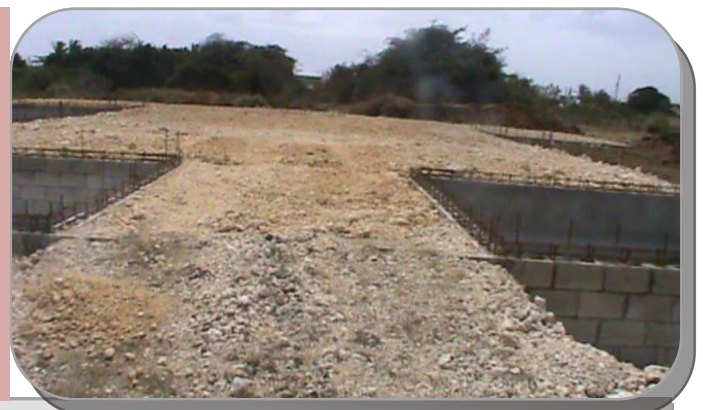
Foundation currently filled with Marl.