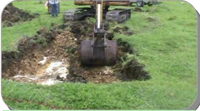
Excavation of Foundation commenced on 24th August 2014