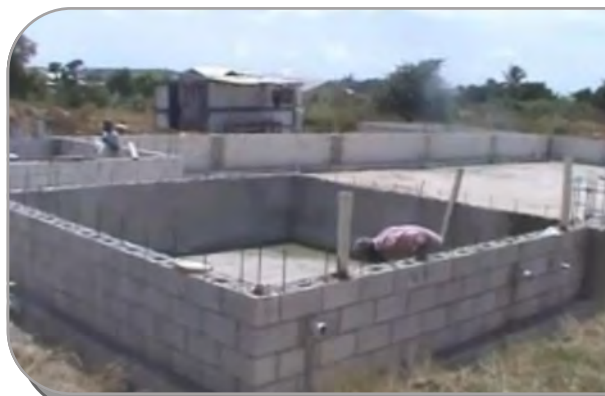
Foundation as at Monday 23 February 2015.