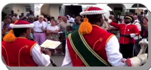
Barbados Defence Force Band.