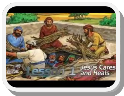
A sample of the lessons to be taught.

The Berean Bible Church is abuzz with news of the upcoming Vacation Bible School . This will be an important way of bringing our children closer to the Lord.