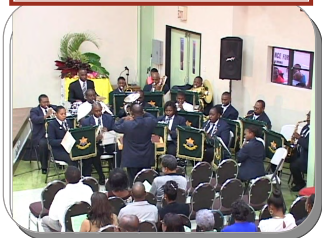
The Barbados Defence Force Band