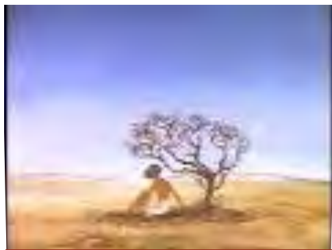
An Artist's impression of Jonah under the tree.

God is omnipotent and omniscient. He has given us a will to choose. With all of our will, God is able to bring His will to bear on us.” He continued with the story of Jonah: “Jonah is sleeping on the ship. God sends a slight breeze which becomes a heavier breeze, which becomes a hurricane. The men do not know where it came from”.