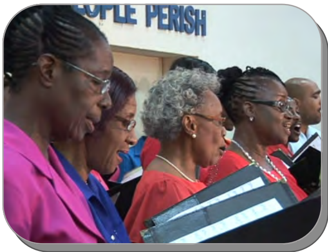
Berean Choir and Friends

this year, actually played a few tunes on the steel pans which they had learnt.