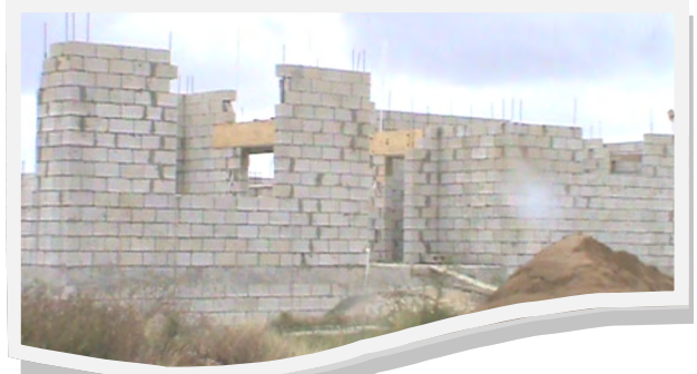
Building Under Construction

tions based on some aspect of the materials for the building process. A table showing the list of materials needed is posted below. Envelopes are being distributed with the label "Donation For Building Materials". If you prefer to donate an item in kind, kindly speak with Bro. Tony to ensure that it is suitable. If you are donating money to purchase an item, you may place it in the envelope and submit it to the treasurer or place in the offering. You can consider paying for an item (e.g window or door) in instalments.