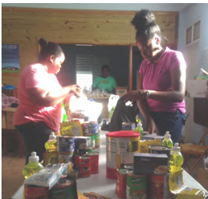
Members packaging food items for distribution