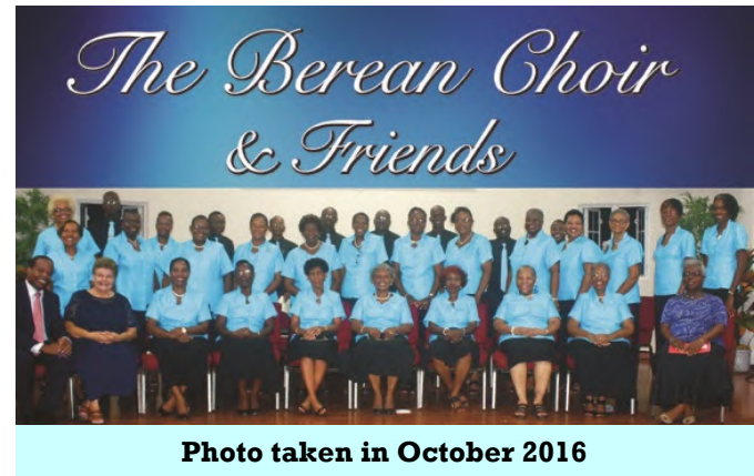
Photo taken in October 2016

The concert was divided into two segments with a