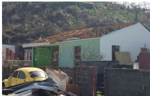
One of the houses of Berean members in Dominica damaged by the hurricane.