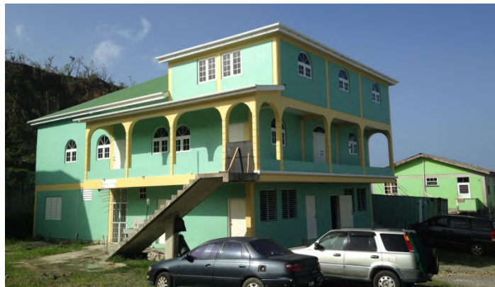
Berean Church in Roseau (Berean Christian Academy)

Teachers and students of the Berean Christian Academy (BCA) are looking forward to the reopening of school this